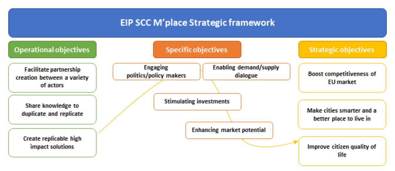
Figure 1 – The Marketplace Strategic Framework

In this context, the attractiveness of the Market Place needs to be enhanced to act as a magnet for case studies that wish to show case. As well, it shall be of reference for those budding projects which are looking for guidance, similar implementations in progress (e.g. to aggregate demand, or to seek solutions or finance) and for all stakeholders, from the supply-side and from the enablers (e.g. financial institutions).