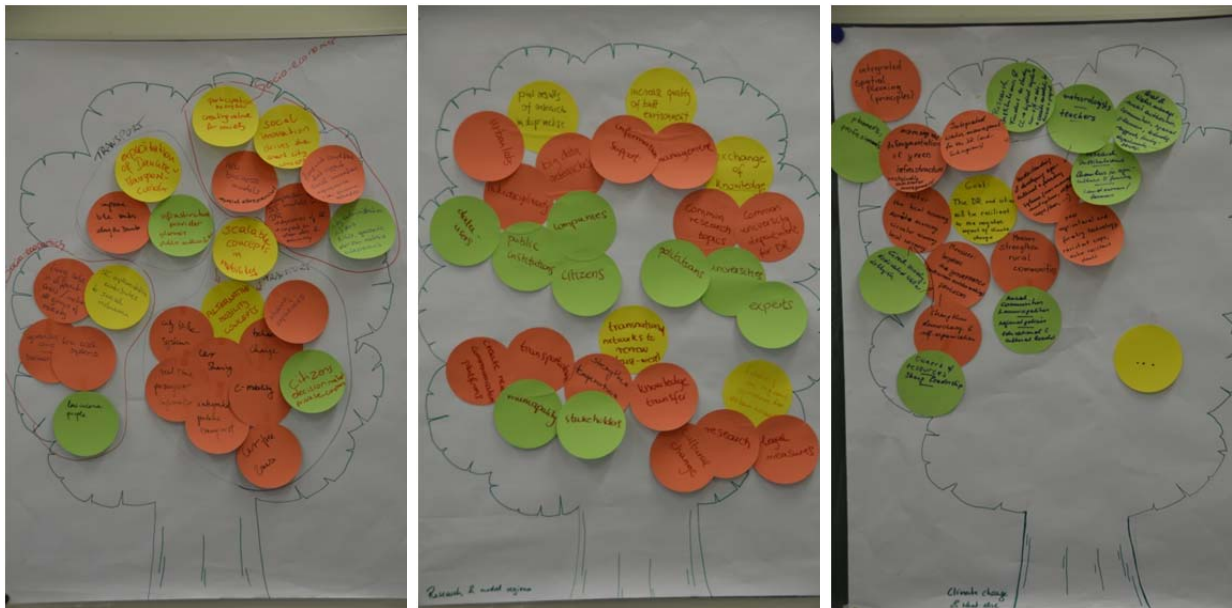
Figure 2 Documentation of the results of the developed trees

During the second part of the participatory session the participants were developing in groups a tree consisting aims for Smart Cities in the Danube Region (yellow), the necessary measures (red) and target groups/actors (green). Attached (attachment number 2) you find the photo documentation of the results of the participatory session.